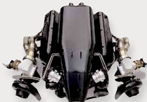
ALIEN INTAKE SYSTEM SHOWN